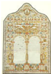
Figure 1. Ketubah

Here the process is demonstrated for a single image, a ketubah (a Jewish marriage license) that was tagged by twenty users [1]. The tags were associated with perspectives by a different group of fifteen users. The ketubah in Figure 1 is from the eighteenth century from Livorno, Italy – this information was available to the taggers as well. The ketubah is displayed in the Museum of the Italian Jewry in Jerusalem.