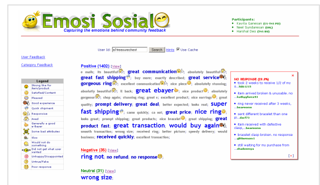
Figure 1: A Screenshot of Emosi Sosial . Tag clouds in the middle under the headlines positive, negative and neutral are the summarized feedback in their respective categories. The pop-up seen on the far right highlights all comments related to the tag that was clicked on. Note that the larger font-sized text are more representative than the smaller ones.

Figure 1 shows a screenshot of our mining system that we call Emosi Sosial . The emoticons attached to the tags give a visual understanding on what the community feels about a seller. The emoticon legend on the left simply makes it easy for users to figure out what each emoticon means.