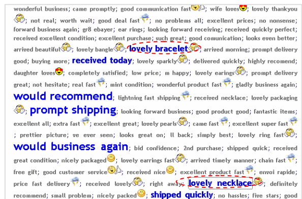
Figure 3: Snapshot of positive feedback in the Jewellery category. Note that in addition to the generic positive comments like “prompt shipping”, category-specific ones like “lovely bracelet” are prominent.

14,000 feedback words the resulting tags are 90. The significant reduction in information is the result of presenting common phrases of high significance as a single phrase. The removal of noise and the use of stop words have also contributed to a more readable feedback summary.